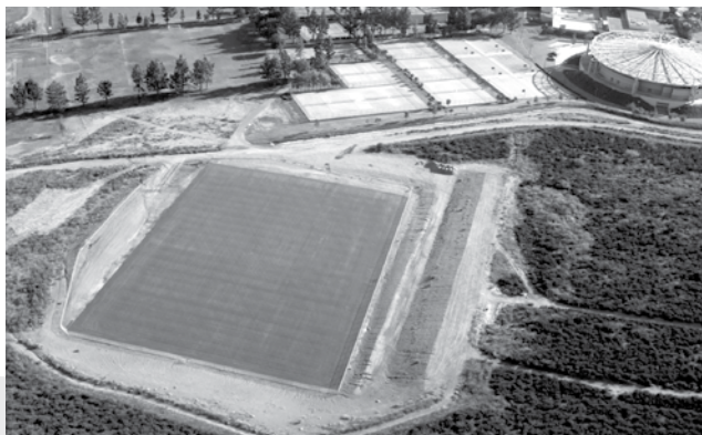
Coyote Premier Field at CSUSB